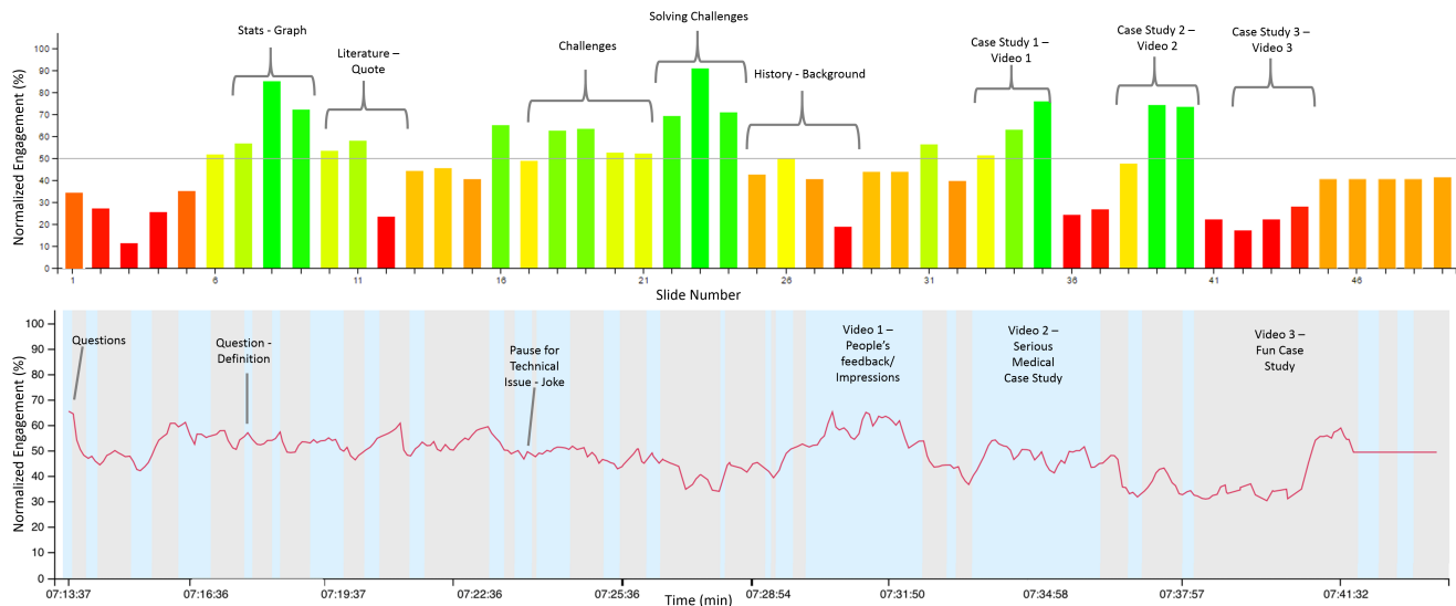
Figure 3. Keynote 2 results: Top graph shows slide scores, slide durations are not depicted, x-axis represents slide numbers. Bottom graph shows the overall engagement levels of the audience members which presenters saw in real-time and at the end of the talk, vertical sections show slide changes. Labels show presentation sections (e.g. videos) or presenter actions (e.g. questions). The two graphs comprise the post-hoc view of EngageMeter.

and develop the normalized engagement range used during the keynotes. All three keynotes took place in the following three consecutive days between 8 and 10 am in a large lecture hall with more than 300 attendees. Participants were free to choose where they sat and were instructed to start the system at the beginning of the talks. EngageMeter recorded the engagement index of each participant during each keynote. We briefed the three keynote speakers about the study a-priori and introduced the system. We placed a laptop on the side of the podium where each speaker gave her/his talk so that they can easily perceive it from their standing position. The three keynotes presented topics related to HCI and Information Technology and had different durations, ranging from 35-45 minutes. We conducted semi-structured interviews with each keynote speaker after their talks, as well as with the participants (i.e., audience) after the conference ended. We gathered participants' subjective feedback after each keynote. They rated on a 7-point Likert item after each keynote their engagement during the presentation (1=not engaged at all, 7=very engaged). Furthermore, we interviewed participants to gather qualitative feedback on aspects they liked or did not like in the presentation.