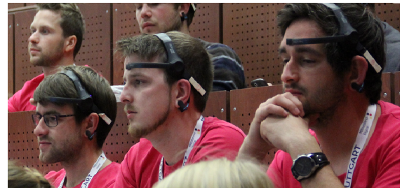
Figure 1. Three participants in a presentation in a scientific conference during the real-world study of EngageMeter

http://dx.doi.org/10.1145/3025453.3025669