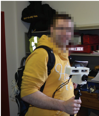
Figure 4: Hand Held prototype.

Our findings from the interview confirms our findings. All participants reported that they had an enhanced experience using the extended views and the complexity of the tasks were drastically reduced. Additionally, 6 participants recommended the usage of both imaging technology in the same view through combing the depth and thermal information via sensor fusion.