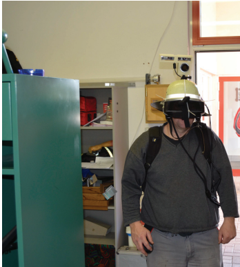
Figure 3: HMD prototype.

We invited 16 participants aged between 20-30 years, 12 males and 4 females. None of the participants have been to the basement before with no prior experience with depth cameras.