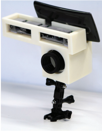
Figure 1: Hand Held prototype consisting of thermal, depth camera and a display for visualization.

(e.g. Kinect) allowed sensing the environment in 3D by utilizing near-infrared spectrum [4, 5, 6]. What makes depth sensing appealing and applicable in various scenarios, its non-visible operating spectrum extends the human visual sensing, yet not occluding with their experience.